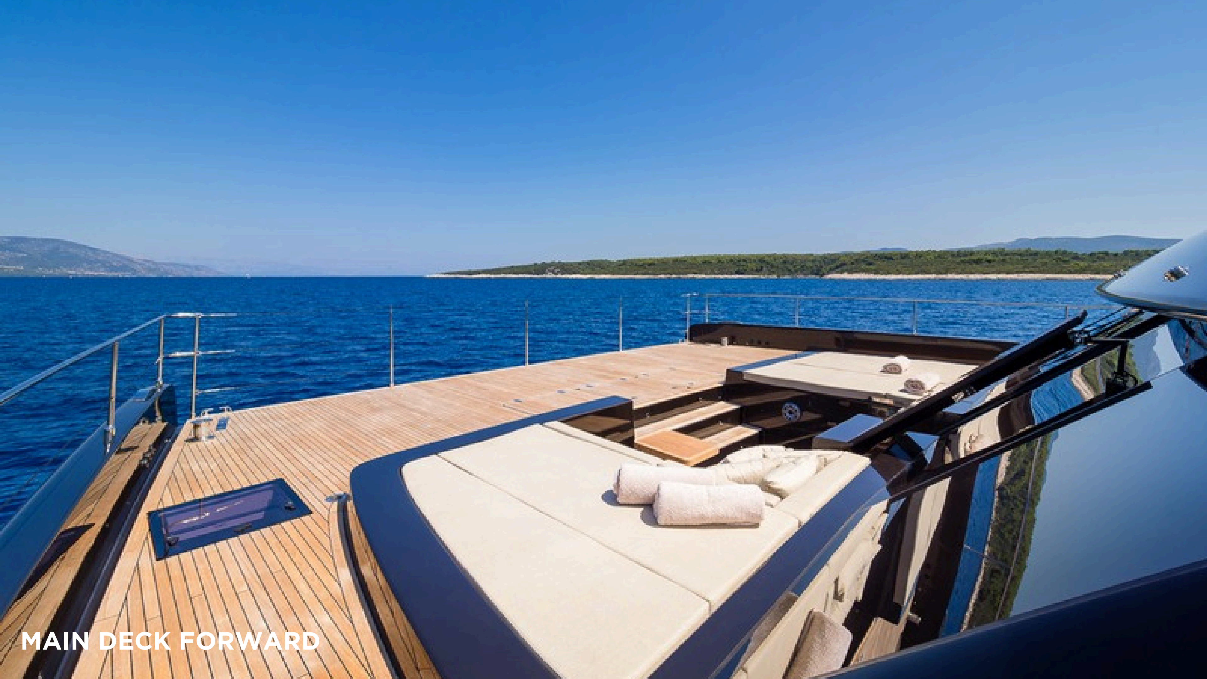
MAIN DECK FORWARD