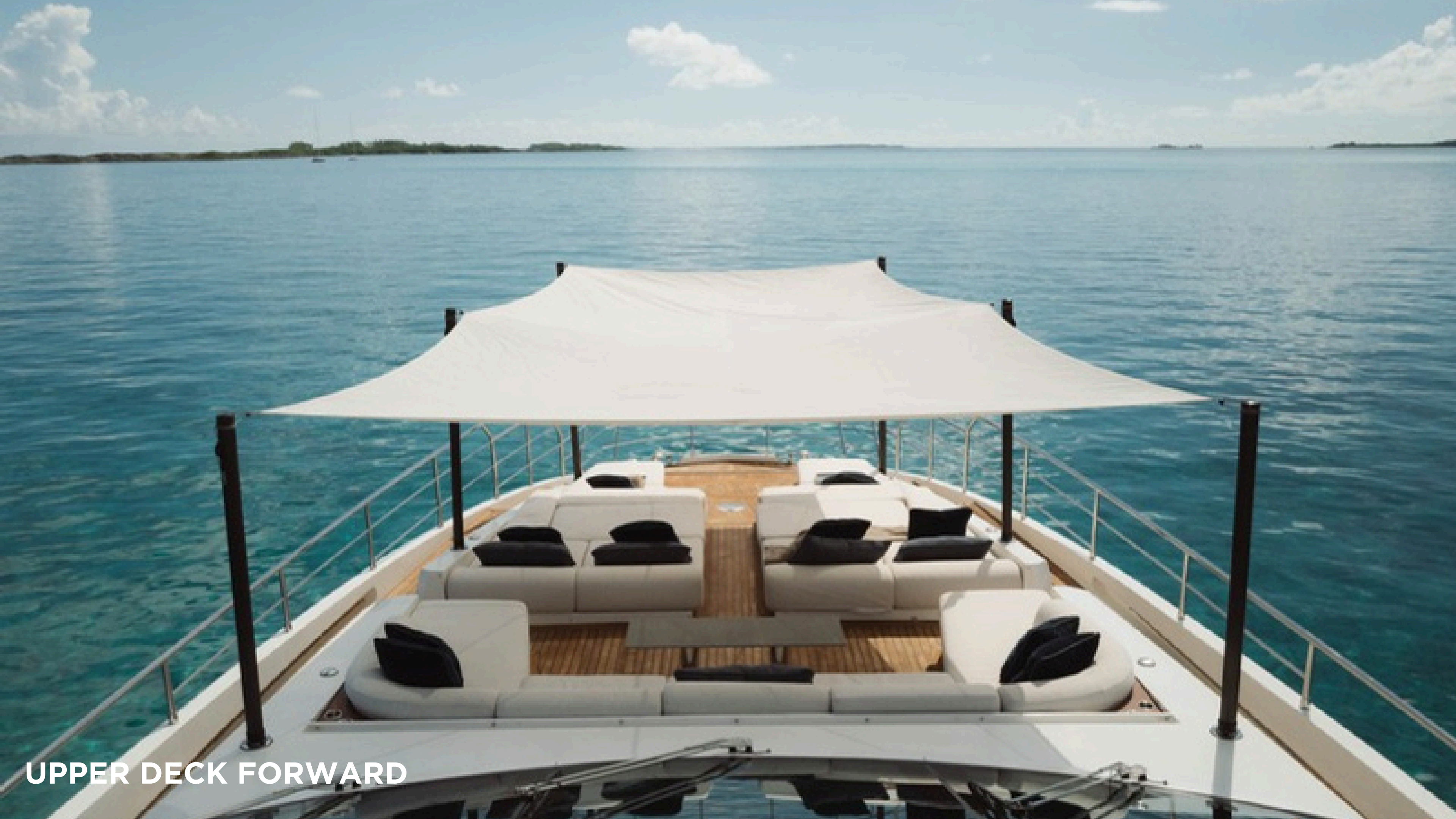
UPPER DECK FORWARD