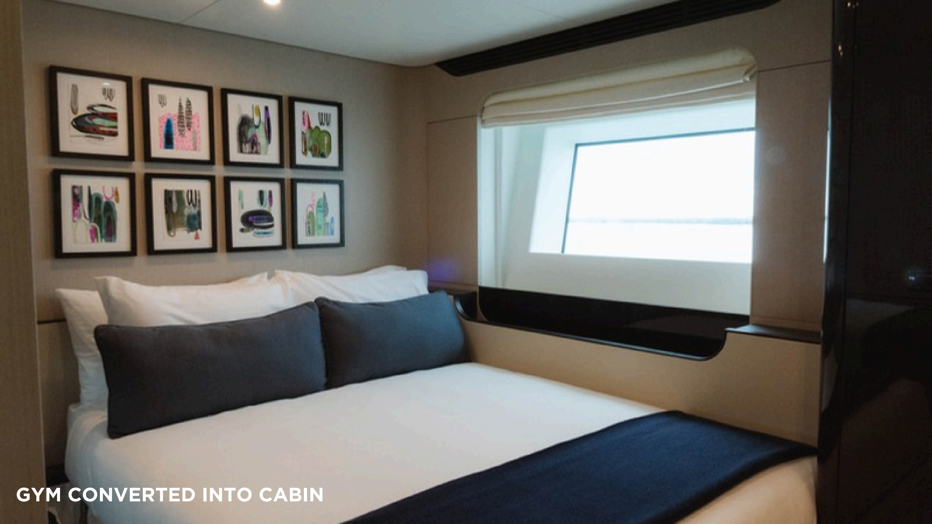
GYM CONVERTED INTO CABIN