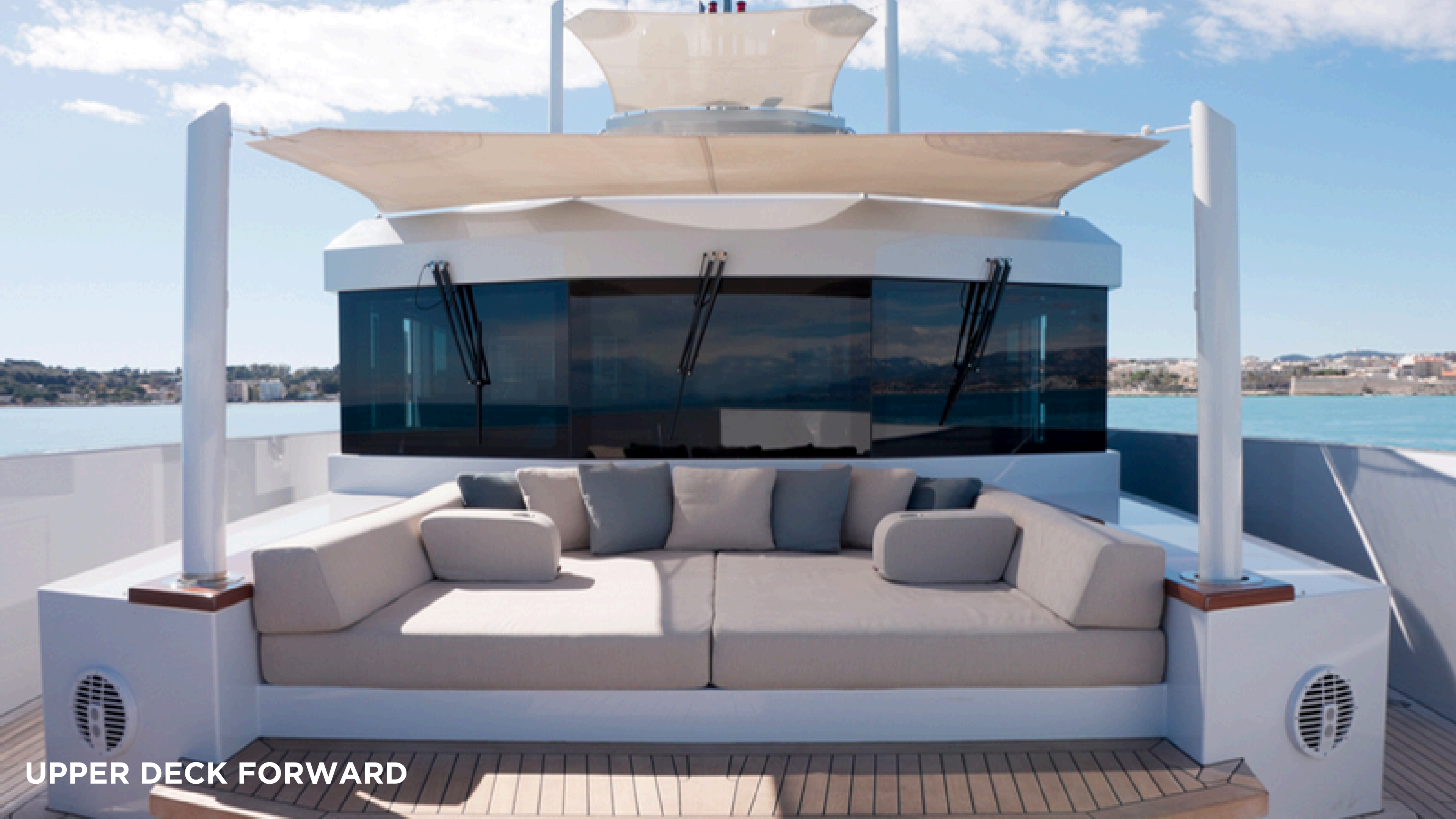
UPPER DECK FORWARD